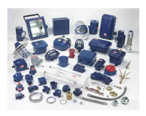
FLEX. Flexible metal conduit.

EXPLOSION PROOF. Conduit and boxes that are sealed for areas with flammable fumes, gases or vapors.