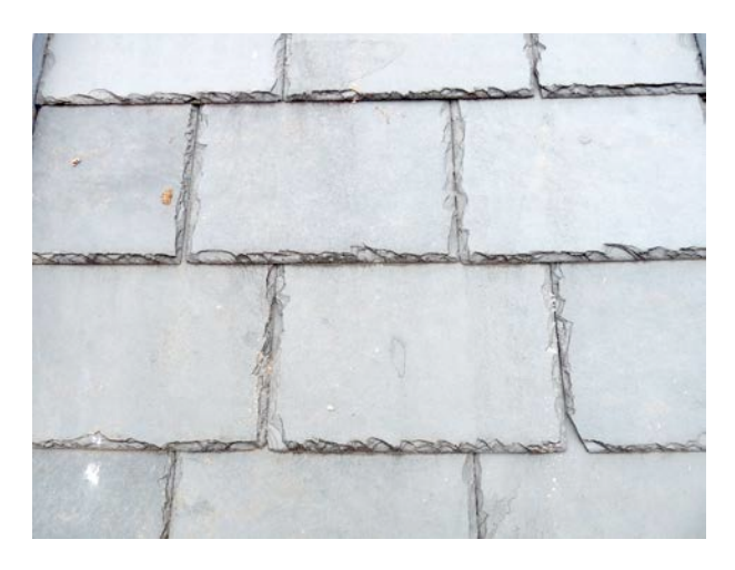
Student Material Book InterNACHI "Inspecting Slate Roofs" online video course