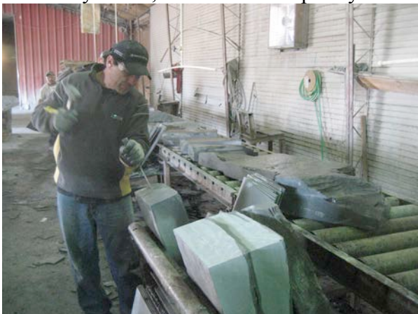
Only the best stone will spit evenly and consistently into tiles thin enough for roofing slate.