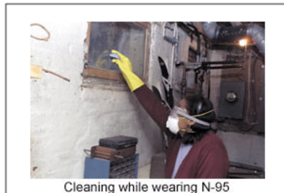
Cleaning while wearing N-95